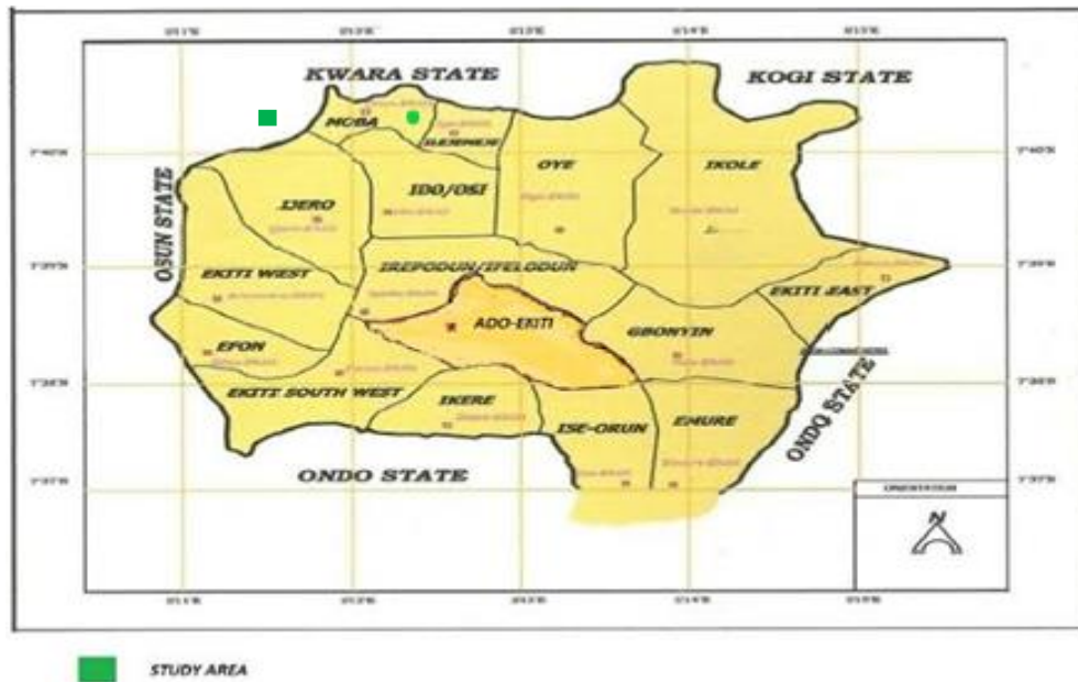
Figure: Ekiti State/Moba LGA map

Ero River is a stream of water moving to a lower level in a channel on land. Ero dam is constructed on Ero River. The dam takes its source form the highland region of Orin-Ekiti in Ido-Osi local government area of Ekiti State. Some of the tributaries of Ero river that contribute to the size of the water fall in Moba local government area including Igo, Ayo, Afintoto, Ipu, Ilogbe, Irara, Ofu, and Igbegbe rivers. The description of Ero river networks is as presented in figure 2.